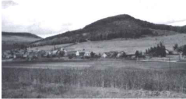
REUSSENDORF CHURCH OUTSIDE: